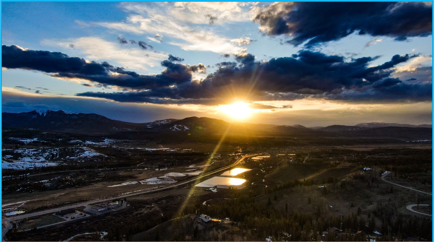
You've got to love the sunsets in Fraser as seen in the photo capture above.