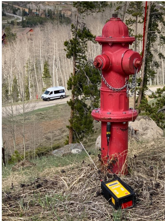
In the photo above, an acoustic monitor is placed by a fire hydrant to detect any signs of leaks.

The Water Utilities crews have begun summer maintenance activities including conducting our leak detection survey. Acoustic monitoring devices are connected to hydrants and valves in order to locate the sound signature of leaks in the pipe. The precise location of leaks and estimated volume of loss can then be calculated by correlating the distance between the receivers. This allows leaks to be repaired in a preventative manner instead of responding to costly emergency repairs.