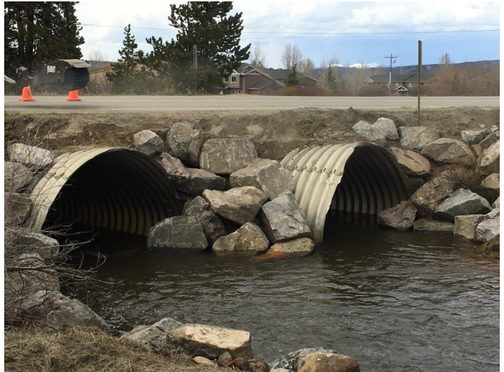
In the photo above, rip rap has been placed to prevent erosion in and around the culverts.

Rip rap along the Fraser River has been added to at the CR 804 culvert and other areas along the Fraser River Trail.